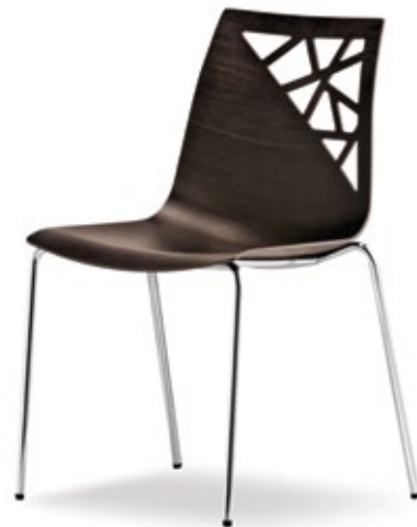
3D Chair v.2